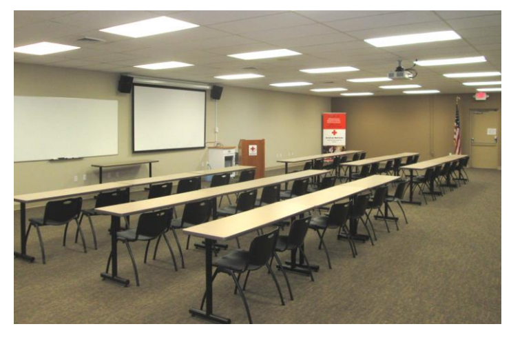
The meeting room.

What you see as you approach the location.