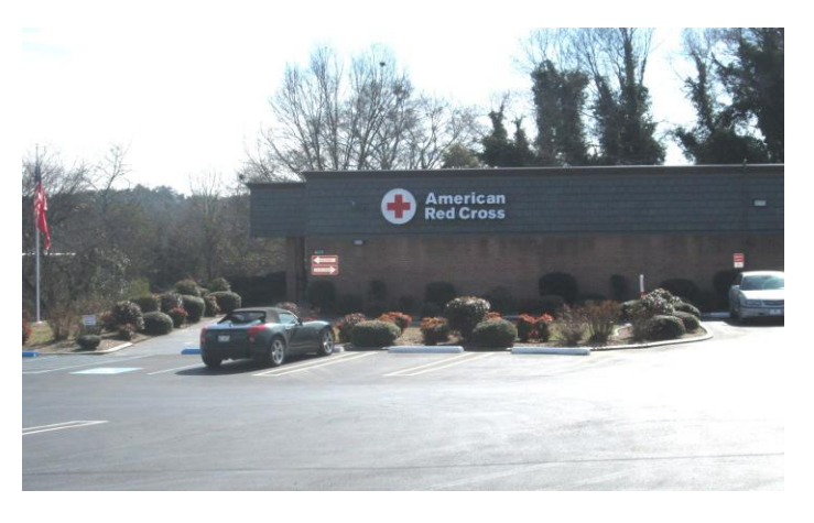
The Red Cross building – main entrance on the left, "Training Entrance" door on the right.